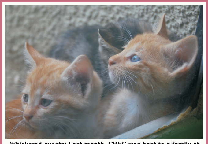
Whiskered guests: Last month, CBEC was host to a family of kittens that took temporary residence with their mother on one of the Centre's window sills.

The review team also appreciated the formal inclusion of literature, Continued on page 7