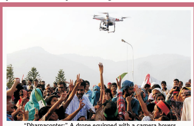
"Dharnacopter:" A drone equipped with a camera hovers over people staging a political protest in Islamabad, Pakistan (http://mashable.com/2014/09/29/drone-beat-hollywood-national-park-fine/)

Drones are controlled through a ground control station which could be as small as a laptop in a briefcase or large, truck-mounted, shelters housing several operators at multiple locations. Drones come in a wide variety of sizes and weights ranging from a few kilograms to several tons. They can be launched by hand or from short runways. A UAV system has two parts, the drone itself and the control system. The drone is controlled from the ground by trained combat pilots or operators each performing Continued on page 4